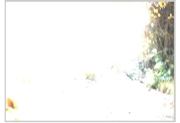
Fig.no.4: HDR Image (not displayable on device)

Fig. no. 4 shows HDR image which is not displayable on device, the HDR images are very high dynamic and most of the display devices is not able to display that image properly. Fig. no. 5 shows the LDR image which has very less dynamic range and easily display on device.