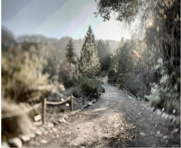
Fig.no.5: Tone mapped image (displayable on device)